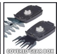
COVERED GEAR BOX