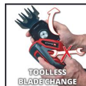
TOOLLESS BLADE CHANGE