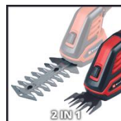
2 IN 1